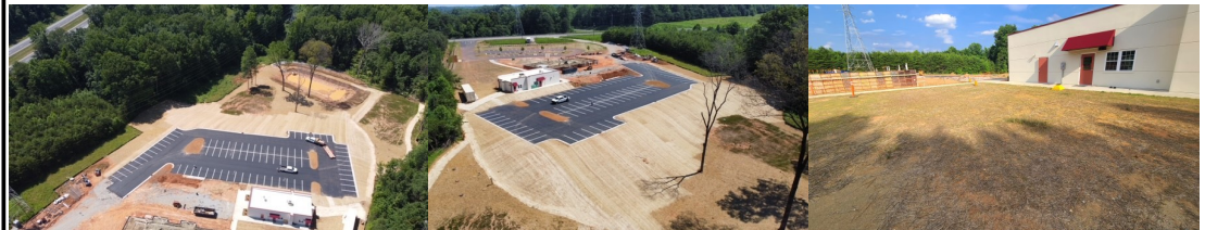
THT New Temple Construction Fundraising Barometer! Donate Generously to Reach the Target and Build your Temple! Pradhana/Main Temple Construction 2.4M Target June 2022, so far raised $601,051 (*Foundation work $400K completed) Bhayaban/Altar Temple Construction and Site Development 1.7M completed with Donations and Bank Loan