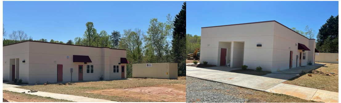
THT New Temple Construction Fundraising Barometer! Donate Generously to Reach the Target and Build your Temple! $565,326 raised and pledged together. Raised $13,503 from last update.